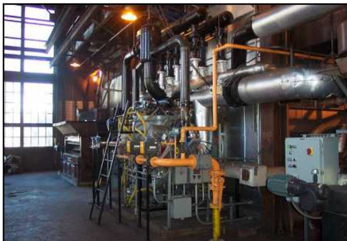
Ashworth Gasifier - Combustor

The Ashworth Gasifier-Combustion System™ is a multi-pollutant reduction clean coal technology that was demonstrated at the Lincoln Developmental Center in Lincoln, Illinois by ClearStack Combustion Corporation. Private funding (ClearStack, Allegheny Energy Supply, Dynegy, Detroit Edison, EPRI) and State (Illinois Department of Commerce and Community Affairs - Office of Coal Development and Marketing, Illinois Clean Coal Review Board, and the Illinois Development Finance Authority) was secured to demonstrate the technology for a total project cost of $3.5 million. The technology is a three-stage coal oxidation technique based on the use of a gasifier stage (limestone added), followed by a slightly reducing gasifier stage followed by a final overfire excess air stage. This technique reduces the major air pollutants, NO x , SO 2 , Hg and other metal air toxic emissions, associated with coal combustion. The technology is patented and capable of biomass co-firing. Testing was completed in March 2003; see test results below. ClearStack is currently working toward the development of a large scale commercial project. The technology can be retrofitted to coal-fired boilers or kilns to reduce pollutant emissions. It is much less expensive to install and operate than a wet scrubber plus selective catalytic reduction.